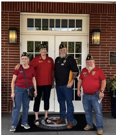
Post 6 Leadership meeting with Fisher House Director