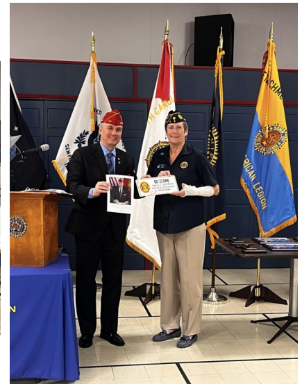
National Commander Seehafer

spoke to all Legionnaires at Post 6 in the morning and then addressed the combined South Carolina Legislature, including the Senate and the House of Representatives, in the afternoon.