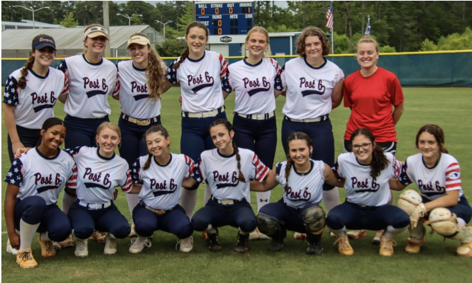
American Legion Post 6 Patriots