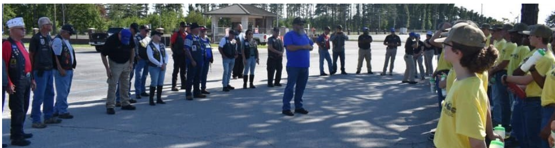
Riders visit the Law Cadet Academy