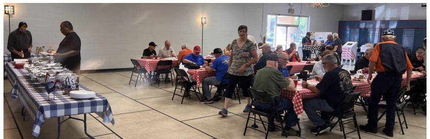
June Veterans Breakfast