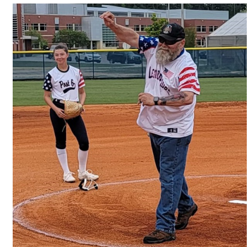
Lz, one of eight folks to throw the first pitch.