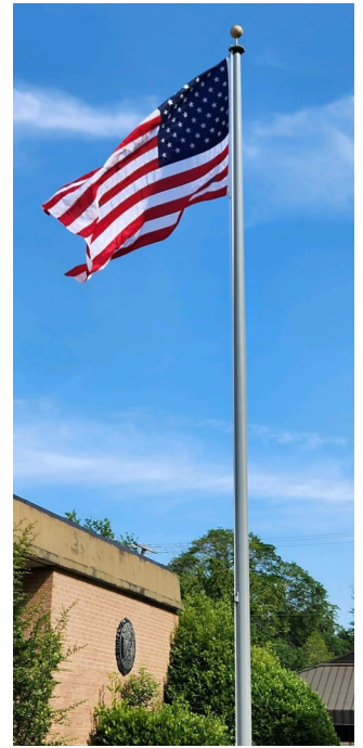
Post 6's refurbished flagpole