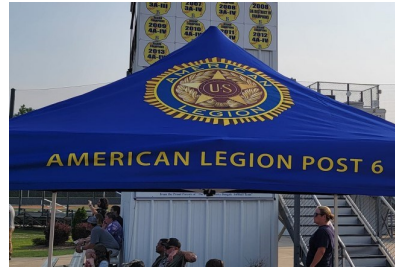
Post 6 Home field gate.